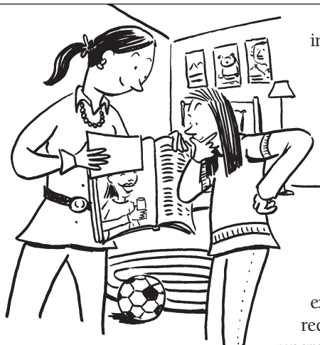
image the company is portraying (example: "Good-looking and popular people drink our soda").

Activity: Cover up brand names in ads. See if your middle grader can guess what they're selling. She may be surprised by how much they focus on attractive models or funny situations rather than on the products. Ask her what